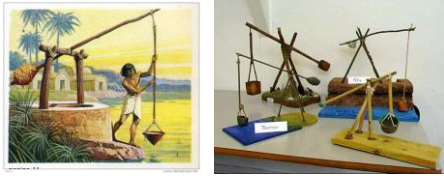
Art / Design Technology

Build a working model / draw an Egyptian piece of engineering such as the 'Shadduf'. Find out why it was so important to their way of life.