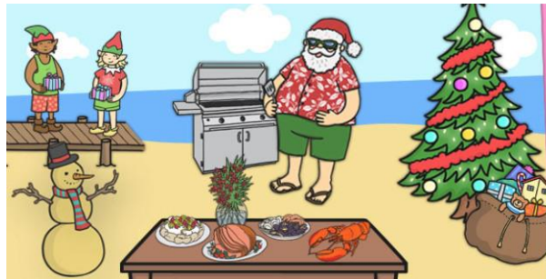
Christmas in UK