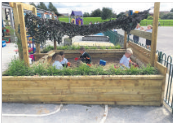
Children play in their new outdoor classroom

A number of schools have transformed their grounds to become outdoor classrooms to enhance children’s learning and development and complement what they learn in class.