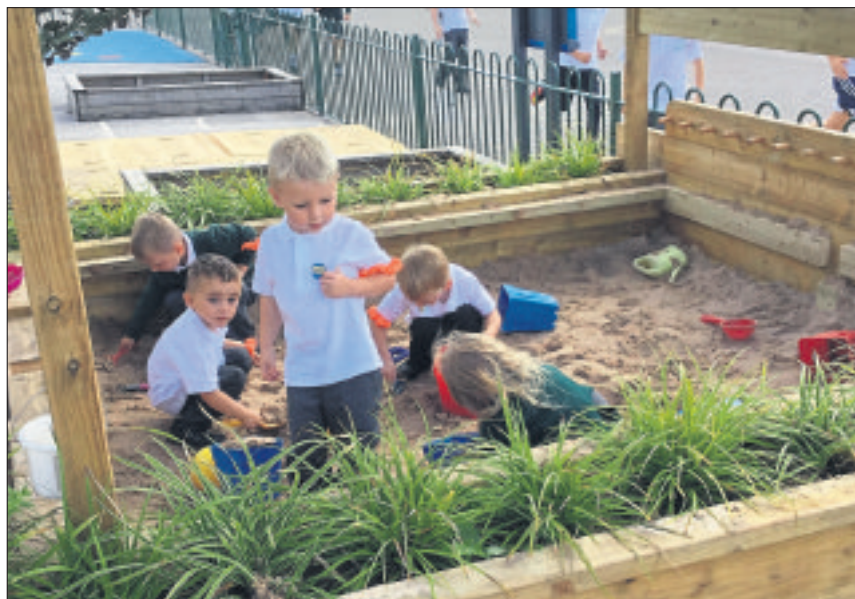
Children at The Gates Primary School explore the great outdoors in their new outside classroom funded by a National Lottery Grant