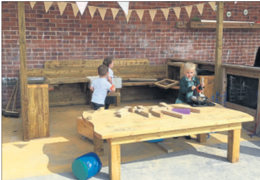
Children at The Gates Primary School learn through play

school trip out up Rivington for nursery children and weekly activities that took place on the school grounds for reception children.